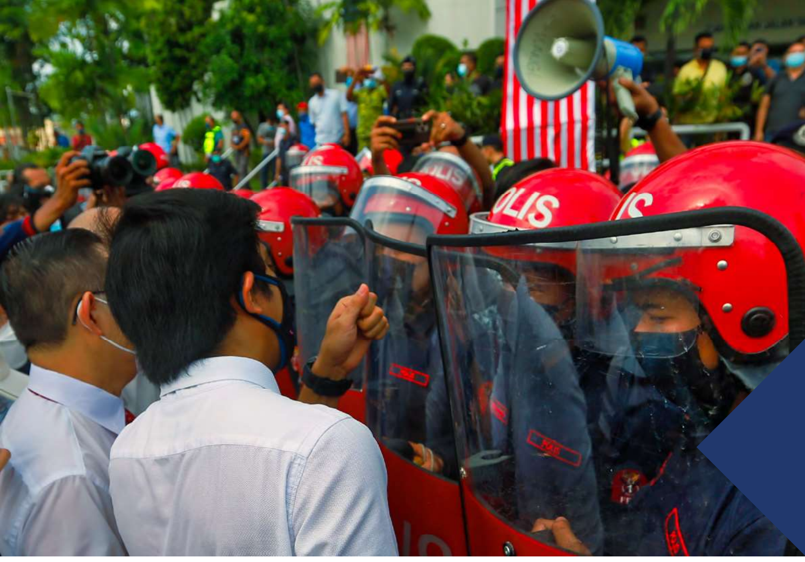
Malaysian opposition members of parliament confront the police after they were not allowed to enter Parliament House in Kuala Lumpur, Malaysia.

The sweeping restrictions were widely condemned as a disproportionate response to the public health crisis, with many accusing the government of attempting to protect its grip on power while avoiding legislative scrutiny. Indeed, the so-called " backdoor " government of Muhyiddin Yassin was never democratically elected but came to power in March 2020 following reported deal-making between political parties, leading to a fragile majority in parliament.<sup>44</sup>