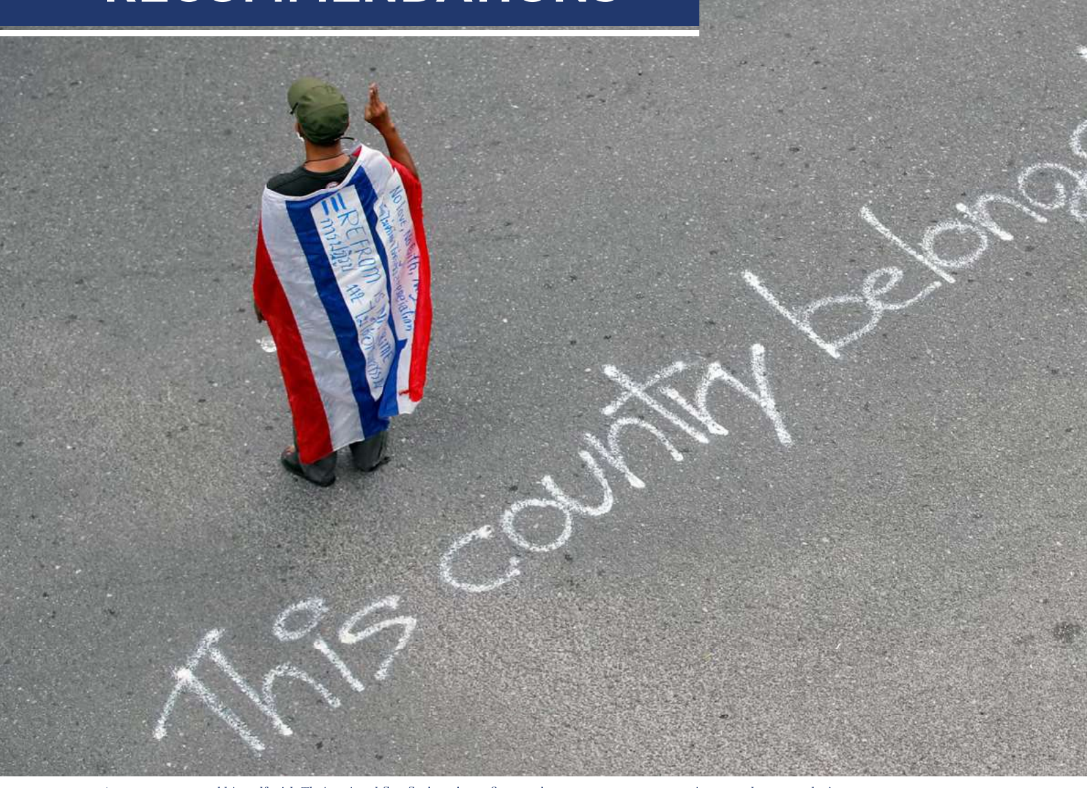
A protester covered himself with Thai national flag flashes three-finger salute next to a sentence written on the street during a street protest in Bangkok, Thailand.

In many ways, 2021 was a dark year for human rights in Southeast Asia. Myanmar descended into chaos after the coup on 1 February and the crackdown that followed. Elsewhere, including in Cambodia, Malaysia, the Philippines and Thailand, the climate for freedom of expression remained severely restricted, with governments using the COVID-19 pandemic to suspend parliament and further criminalize criticism. A broad range of government opponents are facing trumped-up criminal charges, arrest and harassment.