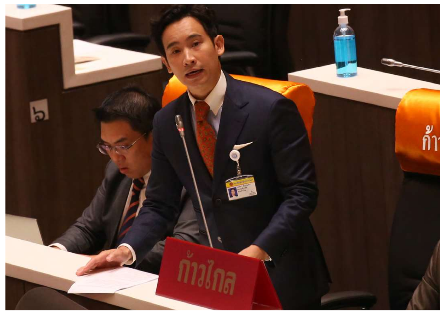
The leader of Move Forward Party Pita Limjaroenrat (speaks during a meeting inside the meeting chambers of Thai Parliament, in Bangkok.