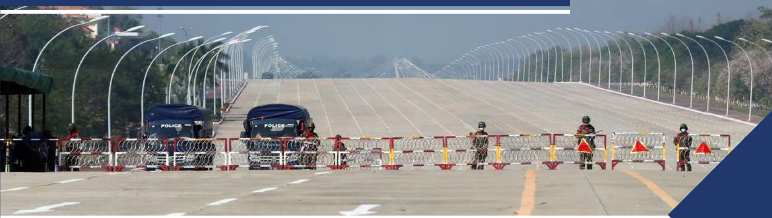
Military vehicles and soldiers block the road leading to the parliament in Nay Pyi Taw, Myanmar.