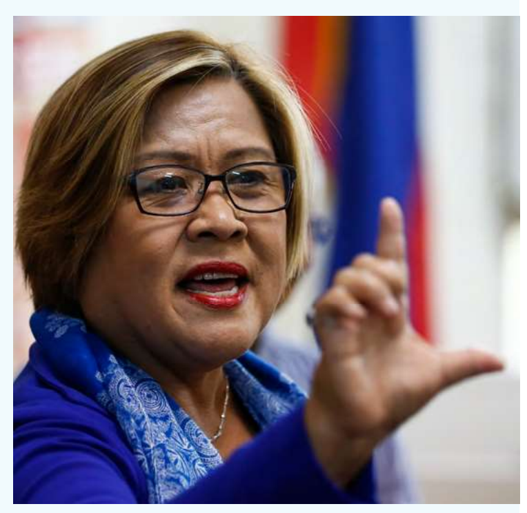
Philippine Senator Leila De Lima gestures after arriving at a metropolitan trial court for her arraignment in Quezon City, Philippines.

The cases against Senator de Lima are politicallymotivated and wholly without merit. Amnesty International, Human Rights Watch and many other prominent organizations have urged her immediate release, while the UN Working Group on Arbitrary Detention has called her a " target of partisan persecution ." Despite a complete lack of credible evidence, only one of the three