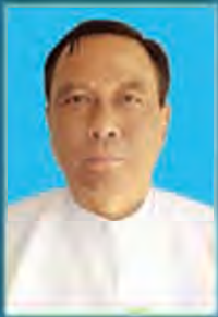
H. E. U Htay Aung, Union Minister, Ministry of Hotels and Tourism

The Ministry of Hotels and Tourism of the Government of the Republic of the Union of Myanmar has embarked on its initial reform strategies for the tourism sector since March 2011, which included smooth entry of foreign visitors to Myanmar, enhancement towards quality service in hospitality, enhancement of standards in service providers and promotion of all year round tourism destinations.