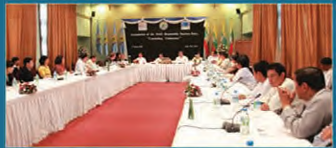
Stakeholders formulating the Responsible Tourism Policy in Nay Pyi Taw.

“Building a viable and sustainable tourism industry in Myanmar requires strong public and private sector partnerships”